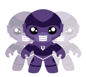
VERSIONOID Make mid-study changes by site